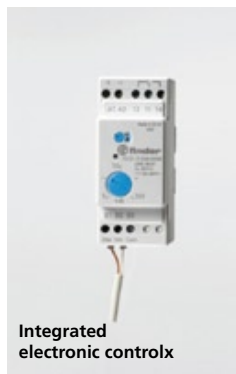
Integrated electronic control